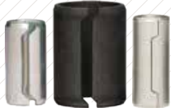
Alignment Dowels / Bushings