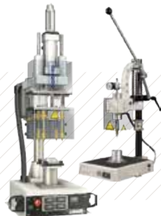
Insert Installation Technology