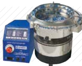
Parts Feeding Technology