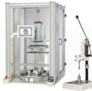
Compression Limiter Installation Technology

Please refer to www.SPIROL.ca for current specifications and standard product offerings.