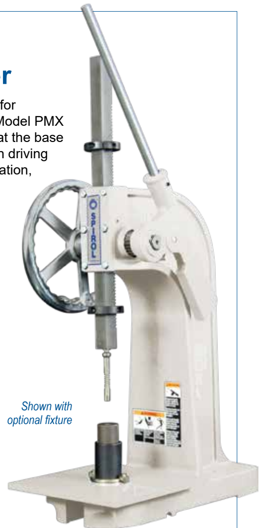
Shown with optional fixture

Easily accommodates SPIROL Pin-Driving Chucks: CXA, CXD