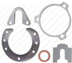
Precision Shims & Thin Metal Stampings