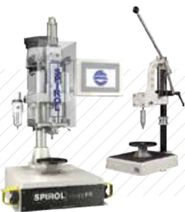
Pin Installation Technology