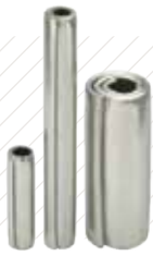
Coiled Spring Pins