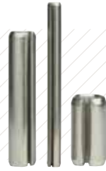
Slotted Spring Pins