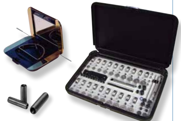
SPIROL® Series 550 Coiled Pins