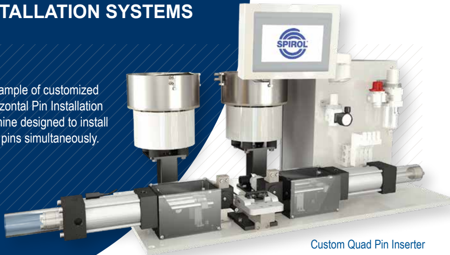
Custom Quad Pin Inserter

Example of customized horizontal Pin Installation Machine designed to install (4) pins simultaneously.